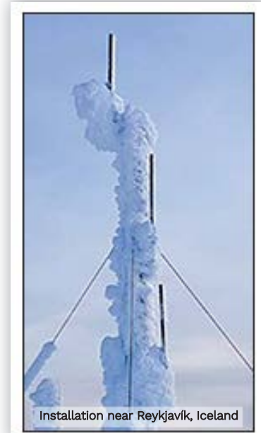
Installation near Reykjavik, Iceland