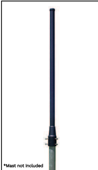
*Mast not included